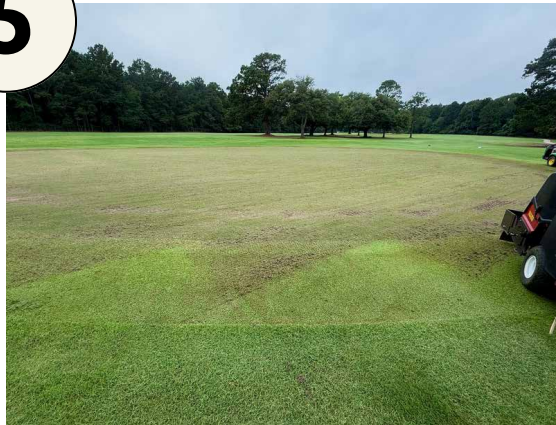
FULLY AERIFIED GREEN