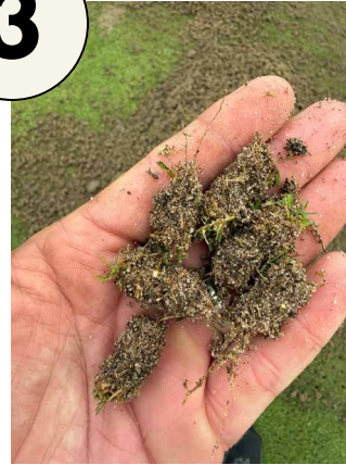
SIZE OF THE AERIFICATION CORES