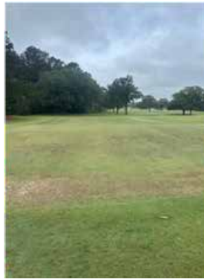
May 20 th