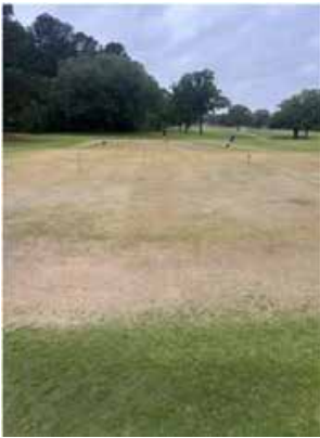
May 5 th