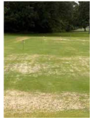
June 21 st