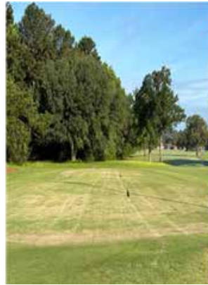
June 5 th