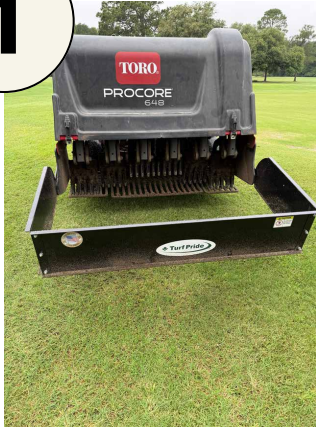
AERIFIER WITH CORE COLLECTOR