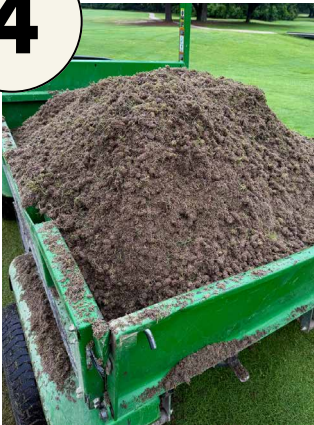
MATERIAL REMOVED FROM ONE GREEN